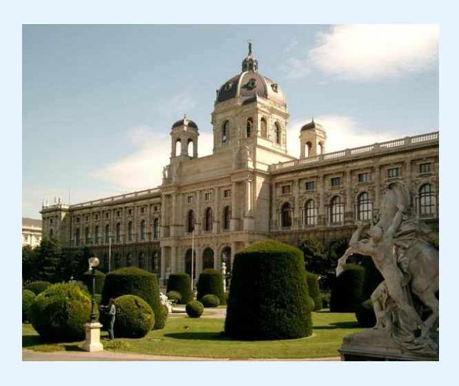
First Announcement and Call for Papers Vienna, November 3<sup>rd</sup> – 4<sup>th</sup>, 2011